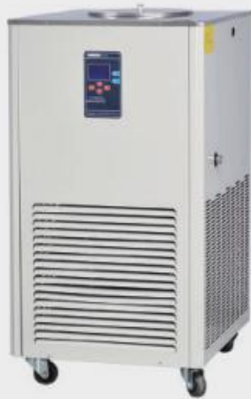
敞口型: DLSB-50/40 Open type: DLSB-50/40