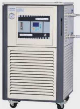
密闭型: DLSB-50/40 Closed type: DLSB-50/40